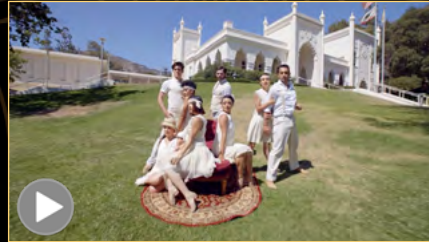
Elite of East Egg: