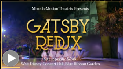
Gatsby Redux promo video